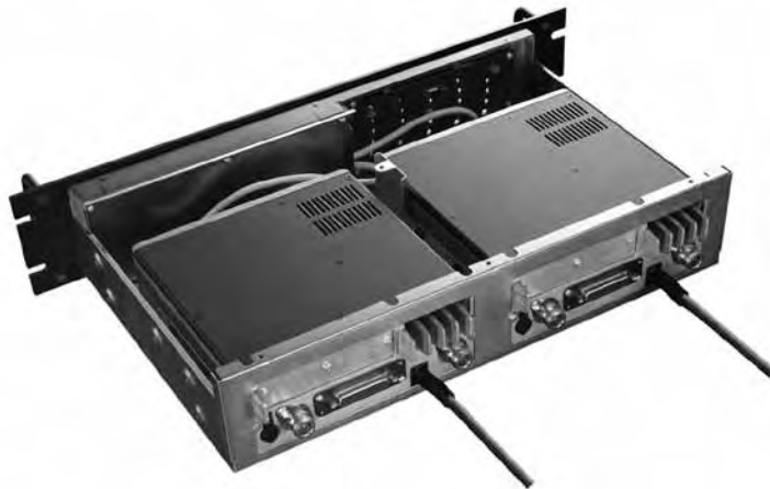
FR5000 with two modules installed