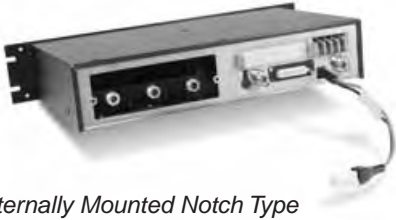
Internally Mounted Notch Type

Please provide specific RX and TX frequencies when placing your order.